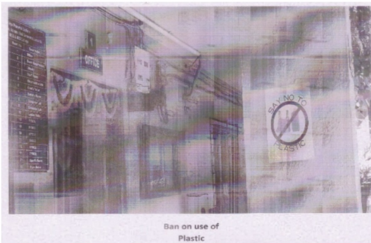
BAN on use of Plastic