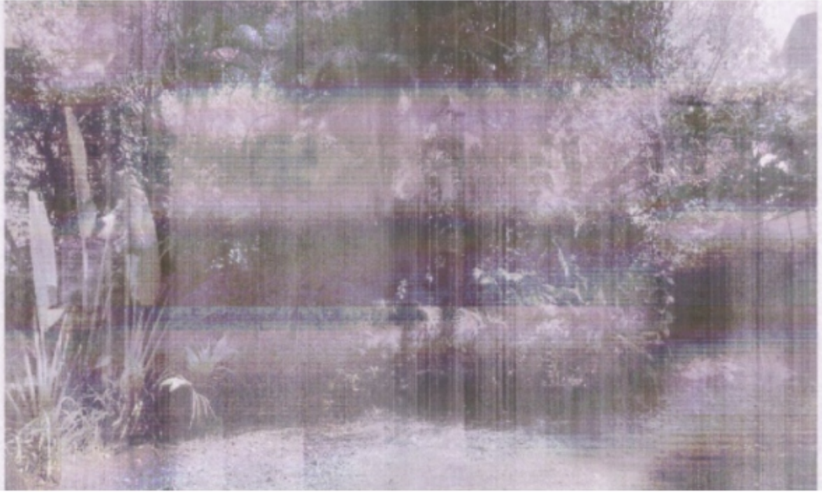
Landscaping with TRESS and Plants